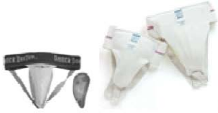
Athletic supporter/male or female (mandatory)