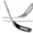
Hockey Stick (mandatory)

NFHA does not advocate any particular brand of equipment. Hockey socks and jerseys may or may not be included in registration fees. It is recommended that skaters include a pair of hockey socks and practice jersey in their equipment bag.